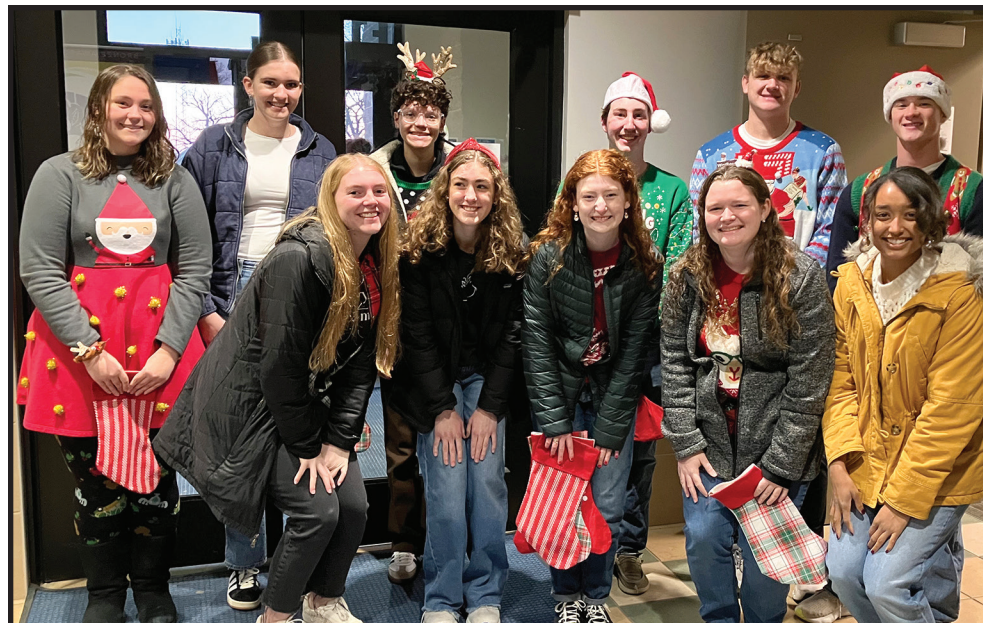
National Honor Society members handed out candy canes to the Elementary students on the last day of school before Christmas break.