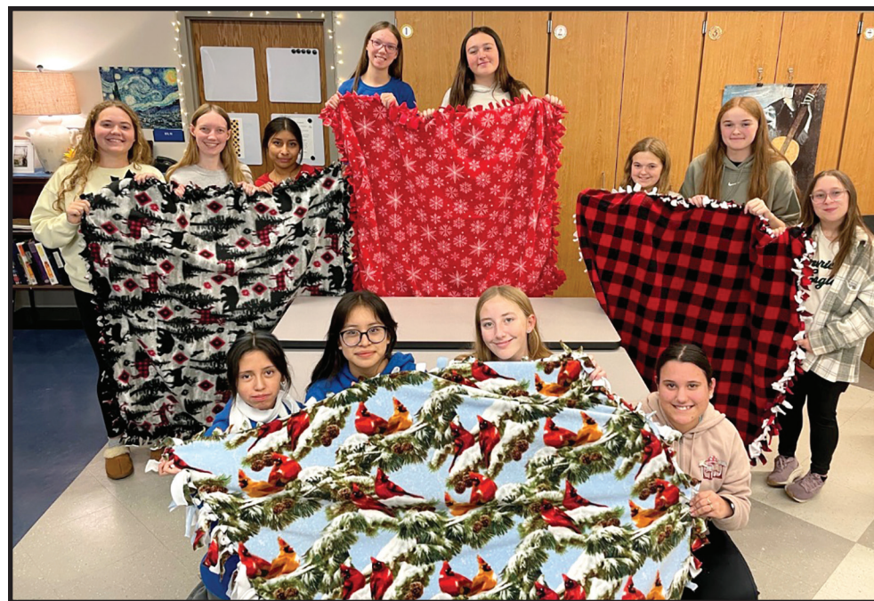
Each year, the Art Club has made blankets to be donated to Haven House to support those in need. Art Club students make it a priority to help others during the holidays, spreading kindness and warmth one blanket at a time!