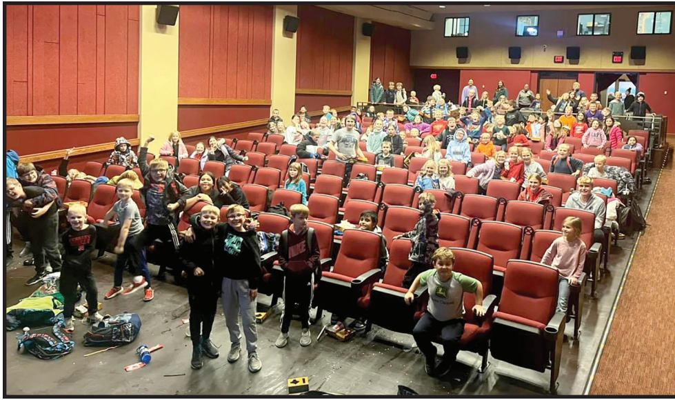
115 elementary kids and FBLA members watched Abominable at the Majestic Theatre in December! Wayne High School FBLA sponsors a Crafts and A Movie event every year. This year they broke their record for students participating!