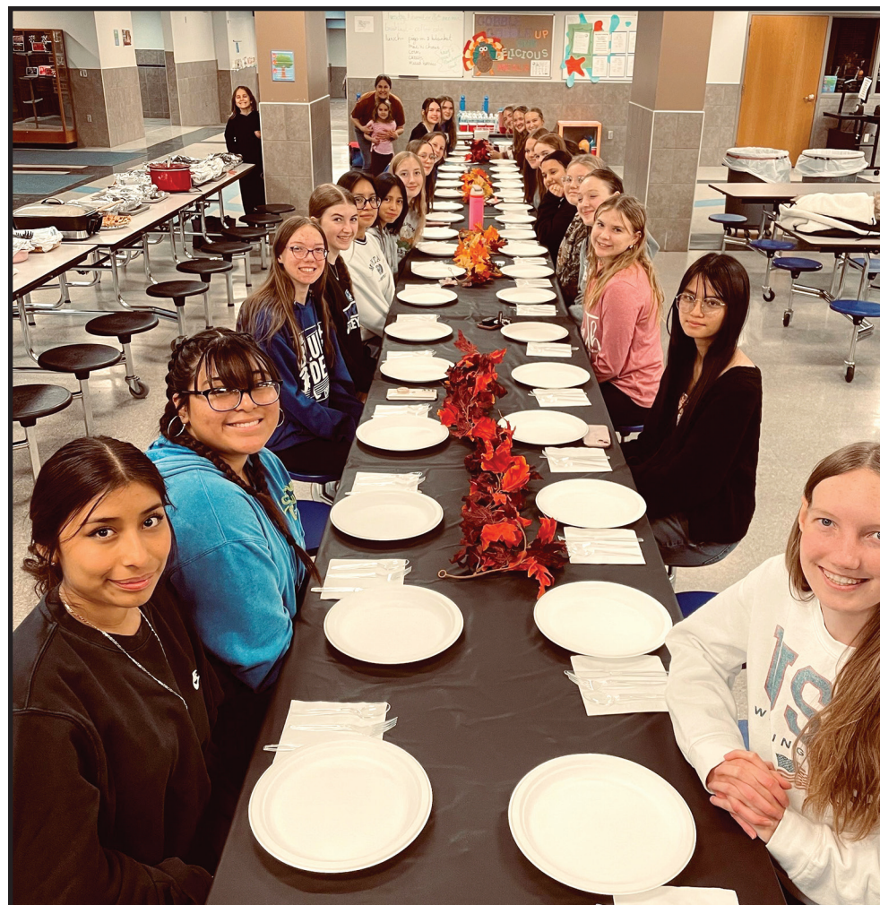
Students from Art Club and One World Club enjoyed a Thanksgiving Feast together! It was such a fun night to spend time together and build our school community.