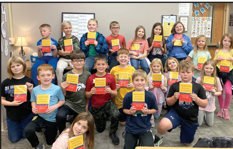
Each Third-Grade student was given their very own dictionary, thanks to the generosity of the Wayne Rotary Club. After the presentation, they put their new dictionaries to the test by solving "Dictionary Mysteries" —like finding out what type of bird a wren is!